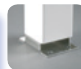
Canopy Post/ Foot