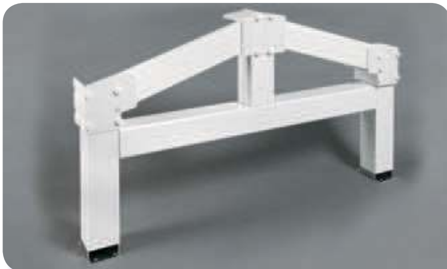
Gable Roof Design