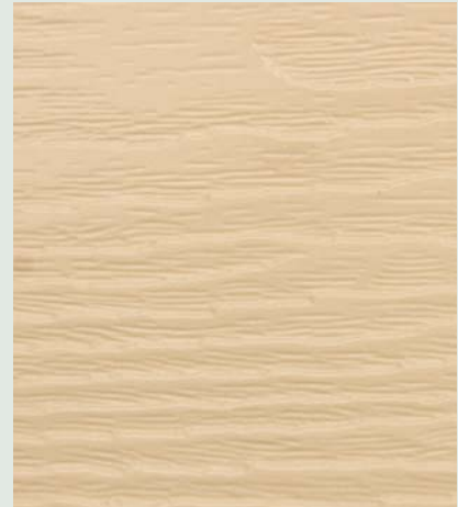
Close up of the woodgrain effect

Fortex ® comes with significant environmental credentials: The Building Research Establishment's Green Guide to Specification recently gave PVC cladding the top A+ rating, when installed with standard products or materials.