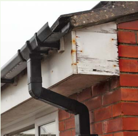
Timber roofline can rot without maintenance...

Freefoam's roofline and rainwater range is different. An occasional wipe down with washing-up liquid and water does the trick.