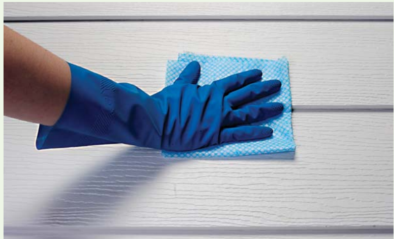
...but a quick wipe down will keep your roofline and cladding looking good.

Goodbye to time-wasting maintenance and hello to free weekends!